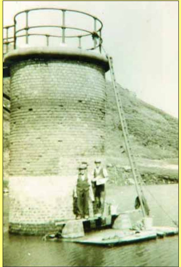
Repairing the brickwork to the tower at Castell Nos Reservoir in 1963

The Reservoir was drained and the necessary repairs made without risk to anyone. All the major coal seams are present in the strata below the Reservoir, varying in depth from 180 feet to 1,380 feet below the dam. In order to protect the dam against mining subsidence, coal was not extracted from the dam 'pillar'. However, coal has been worked under part of the Reservoir and the effects of mining subsidence were at one time seen on parts of the by-wash channel.