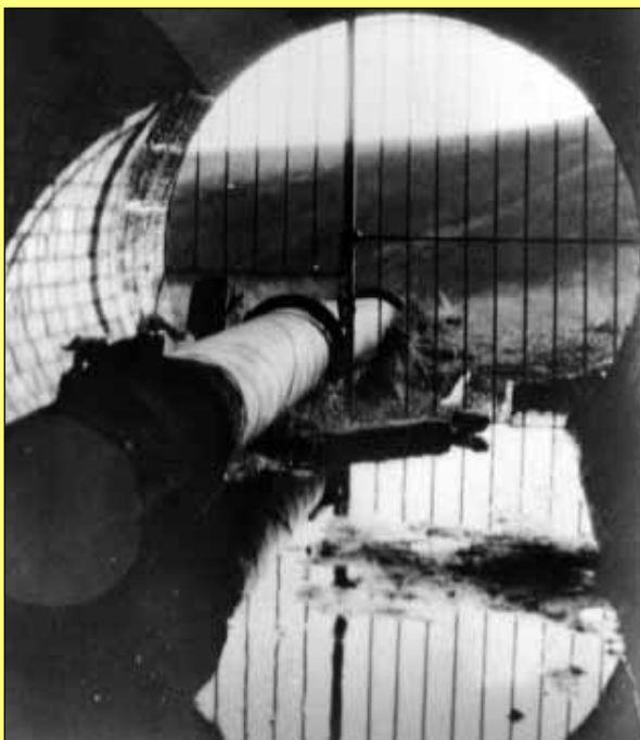
The tunnel under Llest Wen Reservoir in 1963

For many years, a small 13hp diesel-powered locomotive provided the means of transport for workmen between the reservoirs. Mr Ken Mazey lovingly maintained the locomotive. This was abandoned in 1969/70 and access by road from Maerdy or Rhigos is now possible.