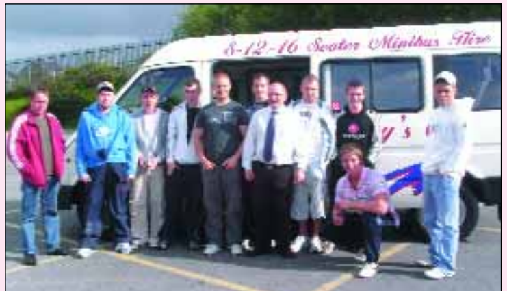
Plumbing attendees & staff

"... the course has been great fun, but I have never met a group who eat so many biscuits!"